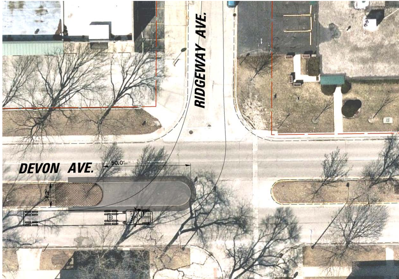
EXHIBIT 1 – Reduced Median